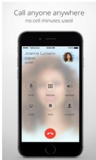
Talkatone App Calling