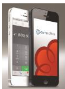
Ooma Office Mobile HD app